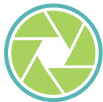
Business and Society